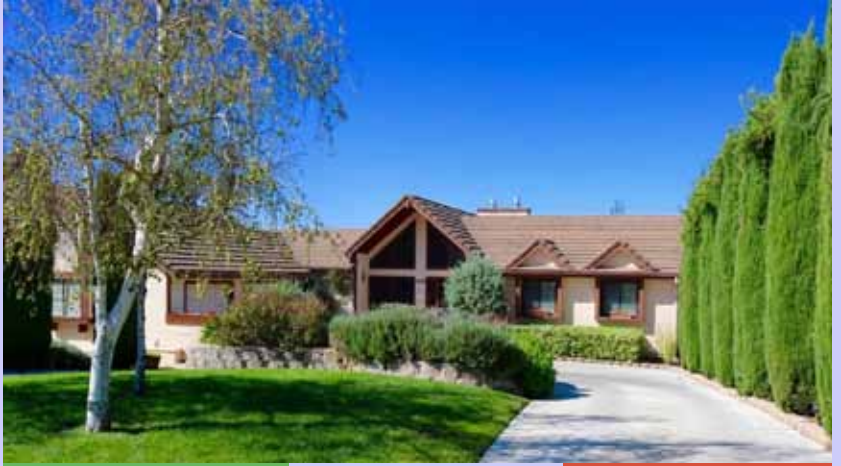
ANNA'S HOME GRAND OPENING For Women & Children