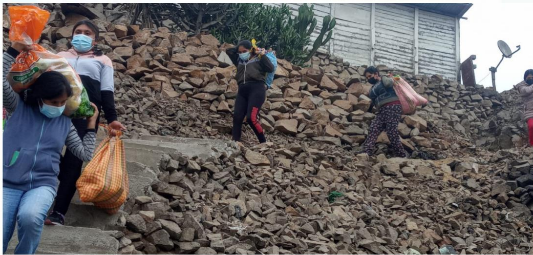
Women members of the olla común "Las luchadoras" (I4) carrying the food to cook