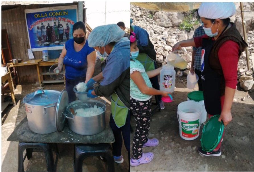
Women preparing food and delivering it.