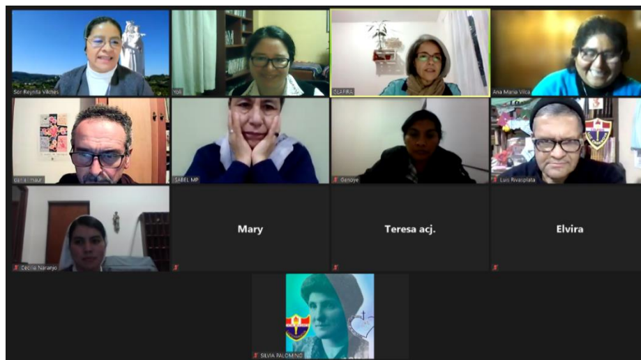
Photo: CONFER committee responsible for carrying out the Listening Process for the Ecclesial Assembly on Saturday, July 3.