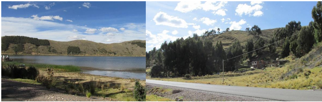
The road to the Community of Cucho Chacamarca, Huancho, Huancané, Puno.