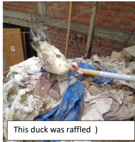
This duck was raffled )

Rinconada has approximately 12 families living there. These families have organized themselves to construct their walls, install their system for water, sewerage and, electricity and even prepared green areas for their parks, without the help of the government, neither local nor national. To help pay for their projects, they raffled a duck. The results were very interesting!